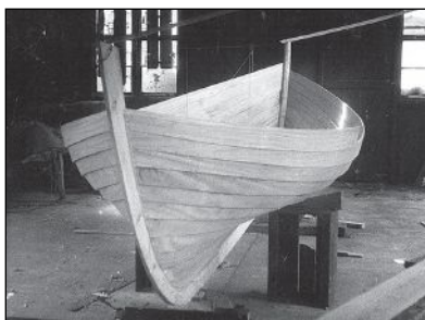
Tom Edwardson built AEGRE in 1966 using 11, ½"-thick mahogany planks per side. The sheerstrakes were larch, and fastenings copper.

From Madeira they sailed to the Canaries, and then the 2,700 miles across the Atlantic to Barbados, which they completed in 43 days. Along the way, they set the storm gaff upside down as a square sail to catch the following breeze, clocking up 103 miles in one notable day, before being becalmed. As it became hotter, they experimented with nudism, though Nick soon discovered it